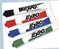
Dry erase marker on top of permanent